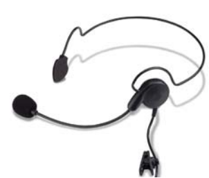
Light Duty Behind the Head Headset HS12-X83