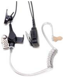
One-Wire Surveillance Kit In-Ear Style SK11NE-X83