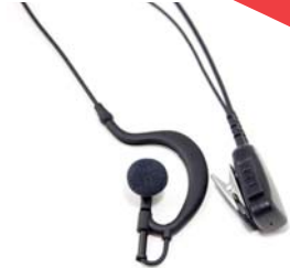
One-Wire Surveillance Kit Ear Hook Style SK11EH-X83