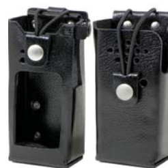
Leather Holsters For RDR3500 & RDR3600