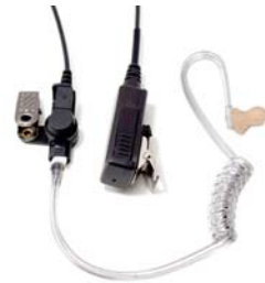
Two-Wire Surveillance Kit In-Ear Style SK21NE-X83