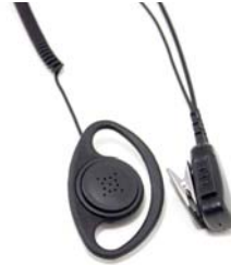
One-Wire Surveillance Kit D-Loop Style SK11DL-X83