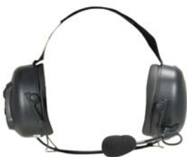
Heavy Duty Behind the Head Headset HS61NR-X83, HS62NR-X83, HS72NR-X83