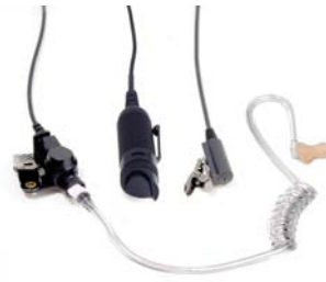
Three-Wire Surveillance Kit In-Ear Style SK31NE-X83