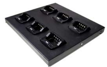
6 Bank Charger CH3506 Kit