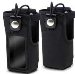
Nylon Holsters For RDR3500 & RDR3600